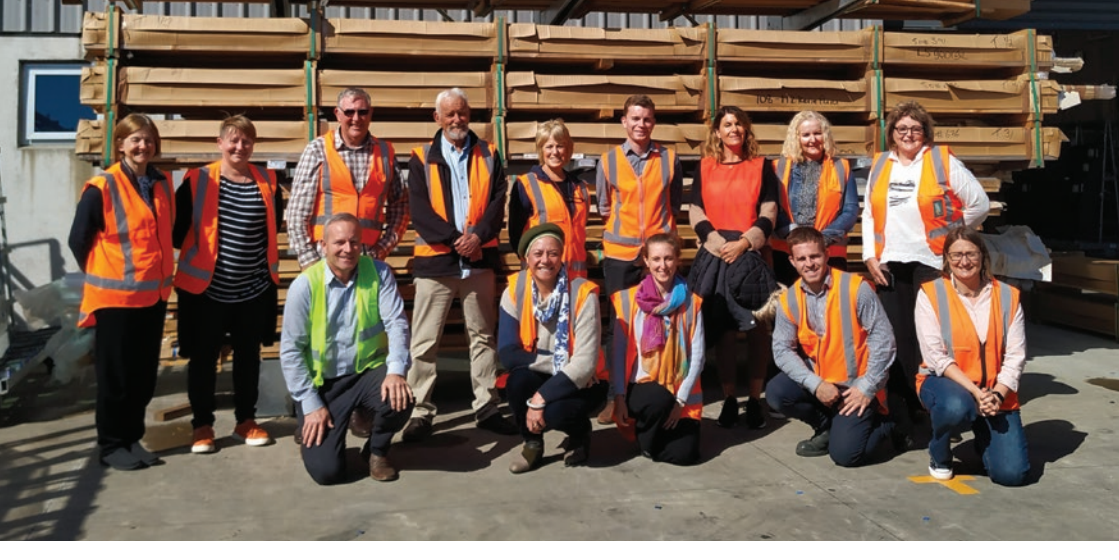
Educators and Enterprises, South Taranaki tour at Total Aluminium